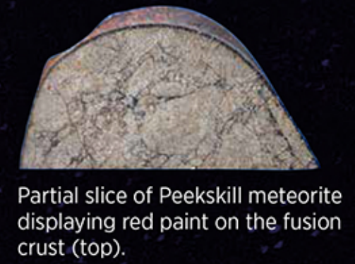
Partial slice of Peekskill meteorite displaying red paint on the fusion crust (top).

Often, hammer stones will retain some marking as proof of their collision with an artifact like scuffs in their outer crust, or paint that has rubbed off from whatever they hit. Hammer stones and hammer artifacts are highly prized for their novelty. In fact, objects that have been hit by hammer stones are often worth more after being damaged than they were worth originally!